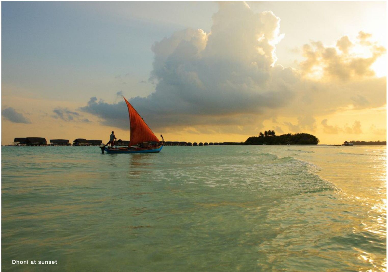
Dhoni at sunset