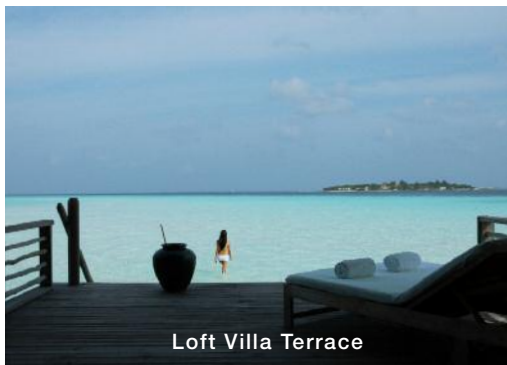
Loft Villa Terrace