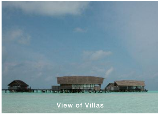
View of Villas