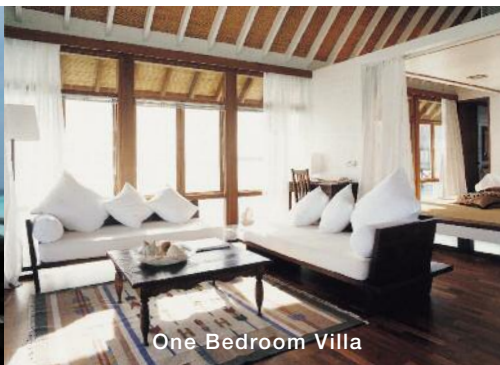
One Bedroom Villa