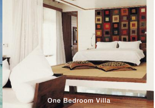
One Bedroom Villa