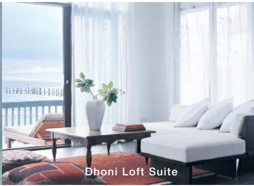
Dhoni Loft Suite